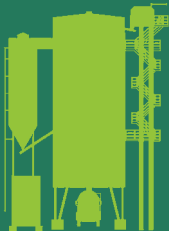
CONCRETE BATCHING PLANTS

Our wide range of products with something for every application is what makes Schwing-Stetter the No. 1 system supplier for concrete machinery worldwide.