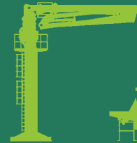
SEPARATE PLACING BOOMS